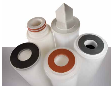
LOFPLEAT AG filter cartridges are available with a variety of gasket, O-ring and end cap configurations.

The micron ratings shown at various efficiency and beta ratio value levels were determined through laboratory testing, and can be used as a guide for selecting cartridges and estimating their performance. Under actual field conditions, results may vary somewhat from the values shown due to the variability of filtration parameters. Testing was conducted using the single-pass test method, water at 9.46 l/min/10" cartridge. Contaminants included latex beads, coarse and fine test dust. Removal efficiencies were determined using dual laser source particle counters.