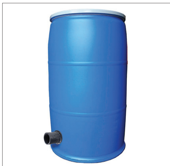
SnapPort® drain applied to a drum